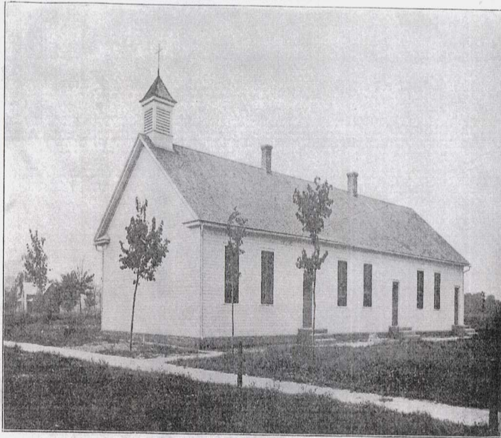
First Church built in 1903; used as School in 1905; Remodelled in 1906.

Kapel gebouwd in 1903; gebruikt als School in 1905; Vergroot in 1906.