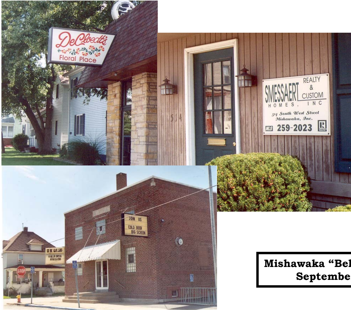
Mishawaka "Belgian Town" Photos September, 2006 - JAV